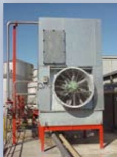
Single Cell Forced Draft with Axial Fan