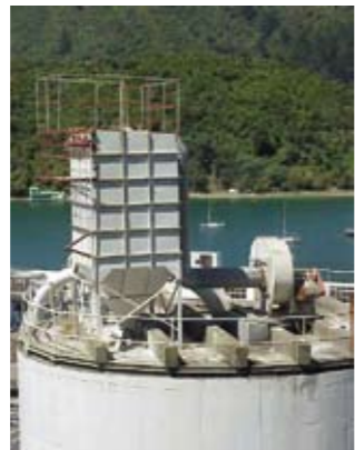
Pulseflow filter venting a cement silo

For mounting directly on to receiver bins or silos, particularly useful in the cement industry. Conventional and insertable designs are available.