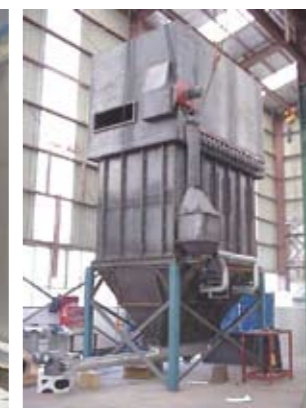
Modular pulseflow bagfilter with walk-in plenum & anti-condensation heater