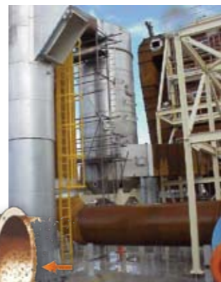
Stainless steel dynamic scrubber