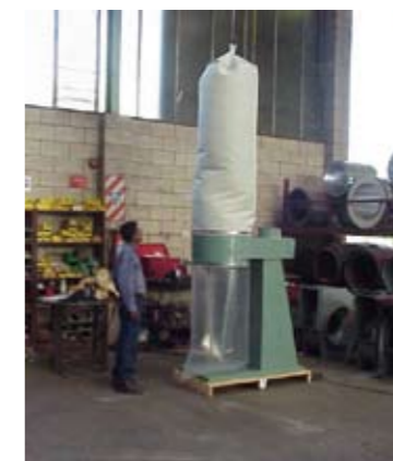
Tradewind single bag unit under test in our factory

For those tiny jobs where the flow & pressure requirements are too much for the off the shelf wood working accessory store product.