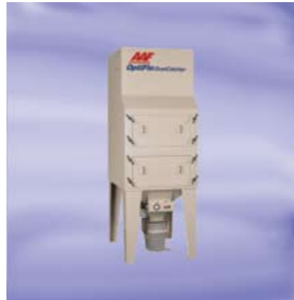
OptiFlow Dust Catcher

A developmental step forward from pulse jet bag filters allowing more compact, lower profile units particularly applicable for installation inside factories and where space is at a premium.