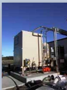
Single & Multiple Cell Forced Draft With Low Noise Centrifugal Fans

Comprehensive range of high-quality cooling towers.