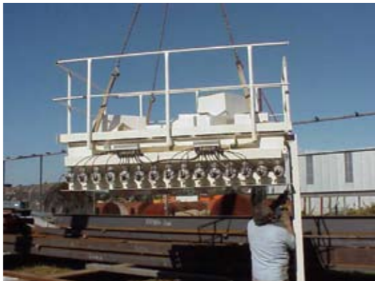
Insertable silo vent pulseflow bagfilter