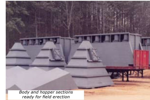
Body and hopper sections ready for field erection