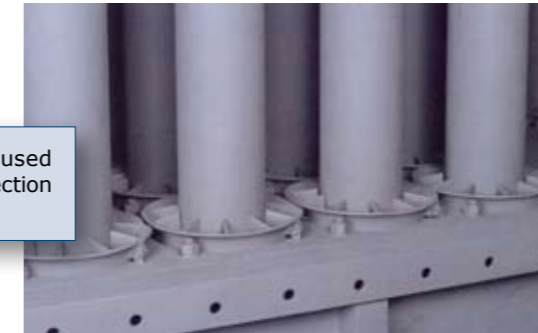
Replaceable, non-plugging cyclonic valves

Cast multi-cyclones are used particularly for fly ash collection after boilers.