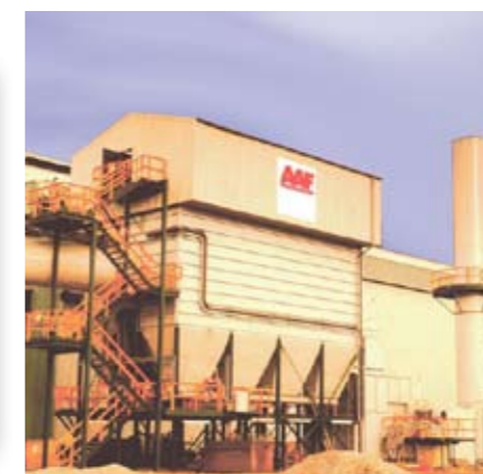
Custom Field erected Baghouse on cement mill