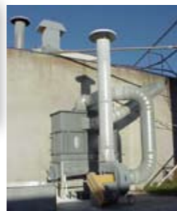
Tradewind No Pump Scrubber with fan