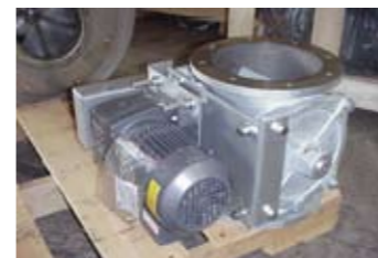
200mm cast rotary valve

For the controlled discharge of dust from dust collector hoppers.