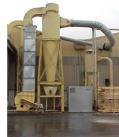
Cyclone installation in wood processing plant

High Efficiency for a broad range of industrial applications. Offering 99.9% efficiency for particle sizes of 10 micron and above.