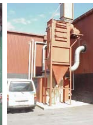
Square welded baghouse on metal polishing application. Fan mounted at high level