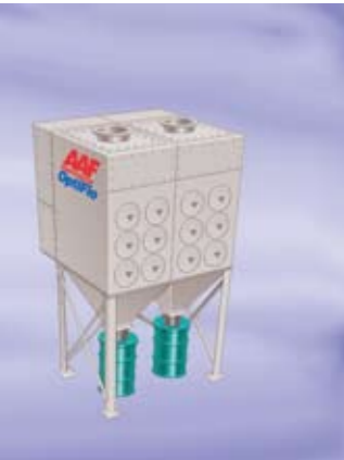
OptiFlow cartridge filter