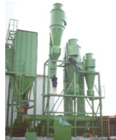
Collection system with pulsestream bagfilter downstream from cyclone set