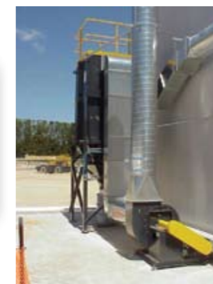
Square welded bagfilter with ground mounted Fan

Available with top removal and bottom removal bags