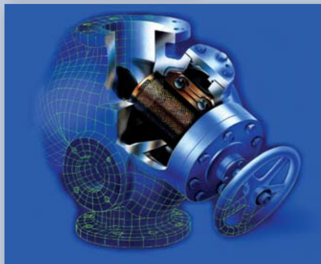
Hellan fluid strainer

Manual & motorised fluid strainers. Suitable for all industrial, medical and pharmaceutical wastes.