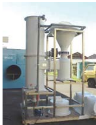
Fibreglass venturi scrubber with separator [Note IPSCO cooling tower behind]