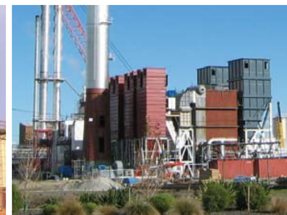
Custom field erected baghouses on large coal fired boiler