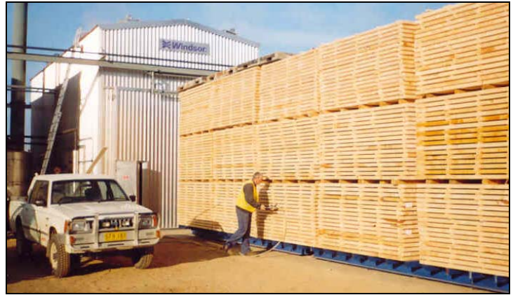
The importance of careful stack preparation